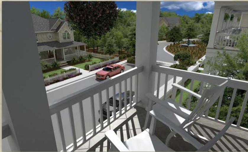
Penthouse Front Porch View