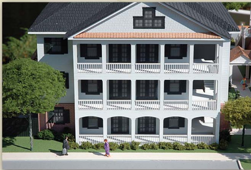
Meeting Park Condominium Residences Front Elevation