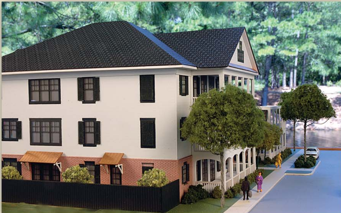
Meeting Park Condominium Residences First Floor "Courtyard" Patio