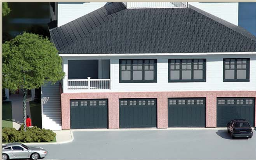
Meeting Park Condominium Residences Rear Elevation