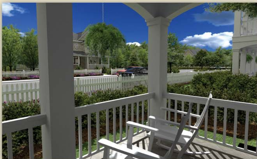
Courtyard Front Porch View