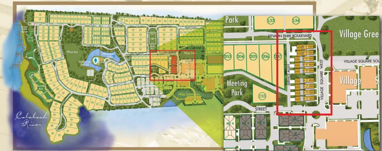
Meeting Park Site Plan