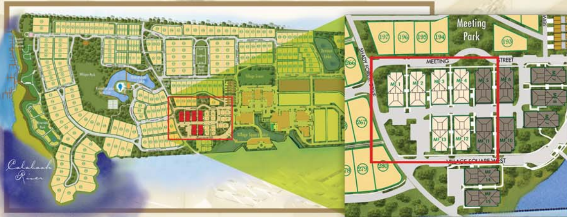
Meeting Park Site Plan