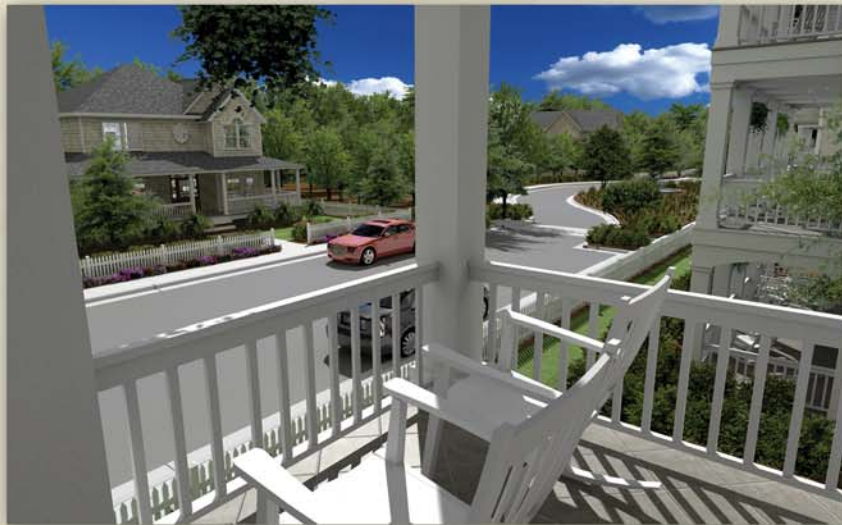
Porches Front Porch View