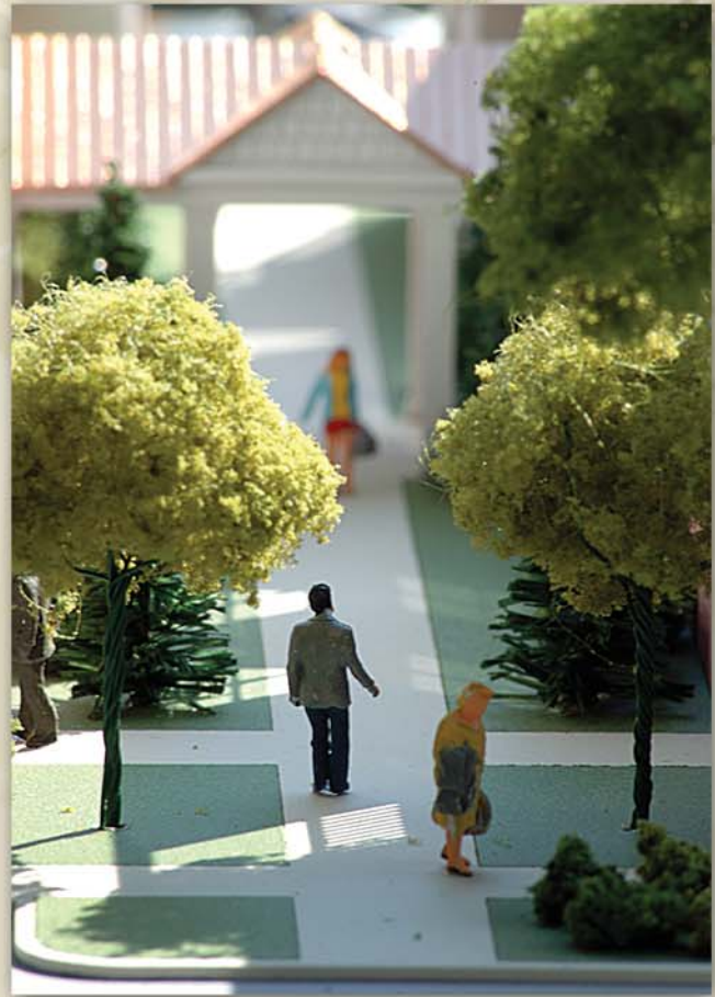
Garden Street Entrance